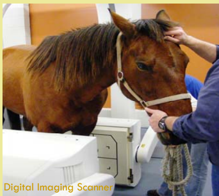
Digital Imaging Scanner