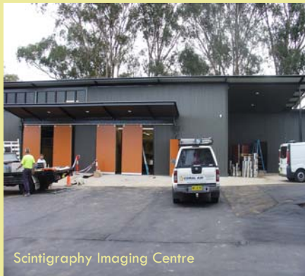
Scintigraphy Imaging Centre

The building also includes two new pump rooms that reticulate water around the campus for both regular use and fire-fighting purposes.