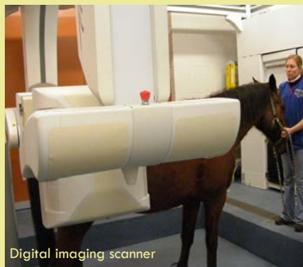
Digital imaging scanner

Next edition: New Law School Building Update